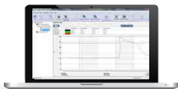
Data Logger Transfer Automatic report generation