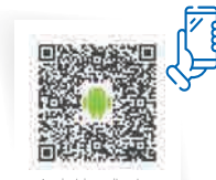
Android application CA Environmental Loggers